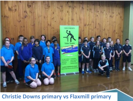
Christie Downs primary vs Flaxmill primary

The “Sporting Schools” program is a fantastic government initiative which provides funding for sports to go into schools and run short introductory coaching sessions. In 2016 we were lucky enough to have 7 schools in the southern region take part in the program and this caused a significant increase in the number of juniors taking part in our Tuesday night program. As part of the program we invite schools to come to the stadium and challenge other schools to some friendly competition. We have received further funding from Table Tennis Australia to continue with this program in 2017 and look forward to building our junior participation numbers even further.